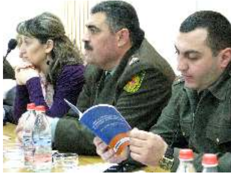
Participants at the presentation of the OSCE-supported study on parole system in Armenia, Yerevan, 2 March 2012.

Reforming the conditional release system and working to establish a probation system are part of Armenia's draft Legal and Judicial Reform Programme for 2012-2016. The Office, together with OSCE/ODIHR, assisted this government reform process by providing recommendations in the area of judicial independence and by offering to assist the authorities to implement the programme upon its approval.