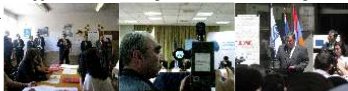
OSCE and EU supported training course on elections administration for precinct election commissioners, the official opening of the Armenian Human Rights Defender's Regional Office in Vanadzor, launch of a workshop for media representatives on responsible and accurate reporting on elections.

In democratic societies, mass media is the main vehicle for political entities to communicate with the electorate during the pre-election campaign period. In order to help ensure a fair and inclusive media landscape, monitoring, particularly during elections, is essential. As a means to bolster accountability, the Office supported domestic organizations in monitoring media coverage of the recent elections. The Yerevan Press Club, a local NGO, was employed to observe and to present the results of broadcast media performance in the period preceding the pre-electoral and during the official campaign period while the Armenian Public Relations Association NGO monitored print media coverage of parliamentary elections held on 6 May 2012. Moreover, on 2-3 April, the Office together with the Europe-in-Law Association organized a training for journalists on responsible, accurate and balanced reporting during elections.