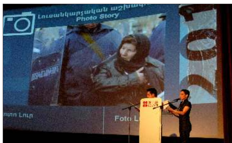
The award ceremony for the Na/Ne (S/HE) annual competition recognizes the promotion of gender equality in the media, Yerevan, 10 February 2012.

On 10 February, the fourth annual Na/Ne media award ceremony was organized by the Office in conjunction with the British Council, the British Embassy in Yerevan, the United Nations Population Fund and other supporters in the spirit of promoting better reporting on women's issues and women's achievements in Armenia. The contest received more than 225 contributions from 136 media outlets, journalists and other organizations. The selection committee, comprised of representatives of media, civil society and international organizations, selected the best works in the categories of TV and radio broadcasting, print, online, blog, photo story, and social and commercial ads.