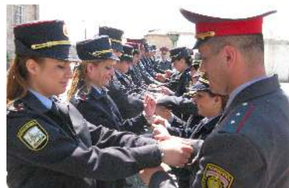
The training courses supported the capacity development of Armenian police officials dealing with public order management, Yerevan, 27 April 2012

The Office continues to support the introduction and implementation of the community policing model in an effort to enhance democratic policing practices in Armenia which began a few years ago with the setting up of a community policing programme in the Arabkir District of Yerevan. As a result of this programme's success, community policing as a practice was officially adopted for the entire city of Yerevan on 1 June. It envisages to establish community policing units with around 300 police officers throughout the city. The OSCE Office also supported a three-week intensive practical training earlier this year for the police officers involved in this effort.