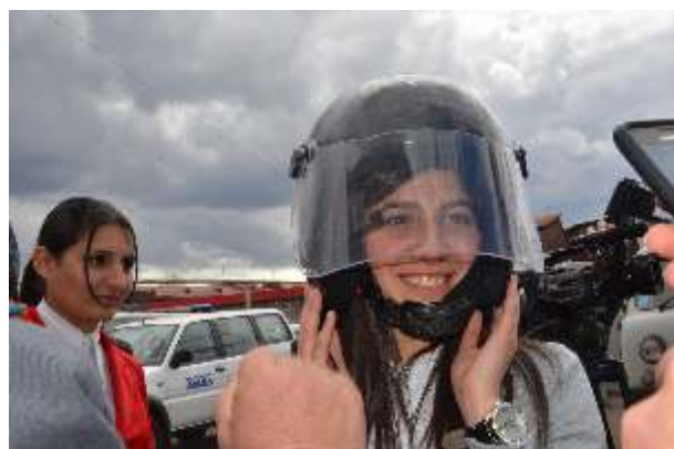
Police open days enhance the trust between the police and the public in the regions of Armenia.

To augment Armenia's police reform process the Office, jointly with the police and the National Centre for Legal Researches NGO, organized police open days in the local police department in the regions of Armavir, Ararat, Tavush, Shirak and Aragatsotn. The events seek to familiarize high schools with the work and functions of the Police. Schoolchildren visited their local Police Departments, familiarized themselves with special means of protection and rode in police vehicles. In addition, interactive lectures and information were given on Police objectives and activities and on the problems related to the trafficking in human beings, drug abuse and corruption in order to raise awareness. Police Open Days are being covered by local TV channels, and school children share their experiences by preparing articles for local school newsletters and other social networks.