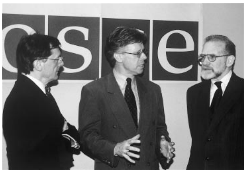
Troika Foreign Ministers (from right to left) Geremek, Vollebæk, and Schüssel in Vienna on 28 April

The Ministers stressed the need for achieving progress in the so called "frozen conflicts" in Moldova and Georgia, while pointing out that the OSCE stands ready to support the parties to these conflicts in reaching mutually acceptable solutions. In this context, a withdrawal of Russian military equipment from Transdniestria could give a new dynamism to the negotiations aimed at resolving that conflict. The Ministers also reconfirmed their support for the efforts of the Minsk Group and its Co-Chairs towards a political solution to the conflict around Nagorno-Karabakh. The Ministers welcomed the preparations to open OSCE offices in Armenia and Azerbaijan in the near future.