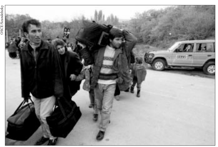
Refugees arriving at the Blace border station in the former Yugoslav Republic of Macedonia