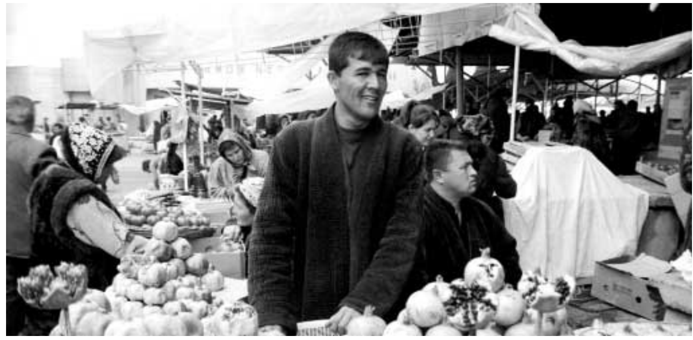
An entrepreneur with his display of pomegranates in Tashkent, Uzbekistan

he OSCE's efforts to rebalance its activities in Central Asia were hailed by the region's leaders when they met the Chairman-in-Office on his trip to the former Soviet states in July.