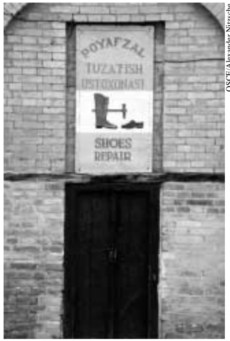
A market niche in Bukhara, Uzbekistan

We also carry out activities that foster co-operation between the business com-