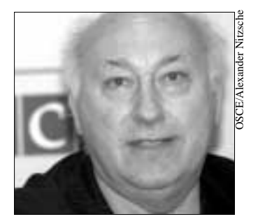
Bruce George, MP and President of OSCE Parliamentary Assembly

that from this conference we'll be able to encourage other countries of the OSCE, not only to have the legislation to protect everyone and make sure that all citizens are treated equally, but also to monitor this legislation."