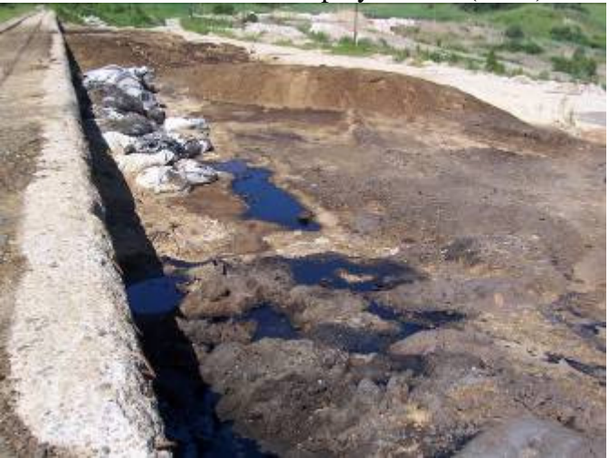
Acid tar dumped and burnt by the sun in Lviv oblast (2005)

Chaotically dumped big bags with a hazardous substance Premix in Zakarpatya oblast (2005)