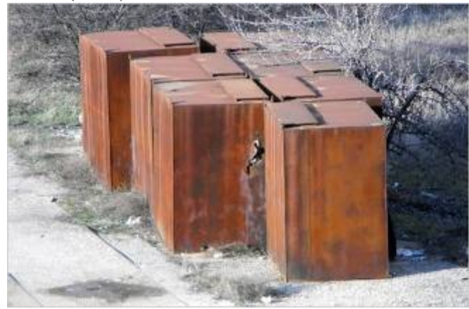
Stained containers with asbestos waste from the ship United States in Sevastopol (2009)