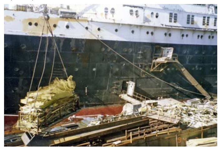
Asbestos waste unloaded from the ship United States in Sevastopol (1993)

Acid tar dumped and burnt by the sun in Lviv oblast (2005)