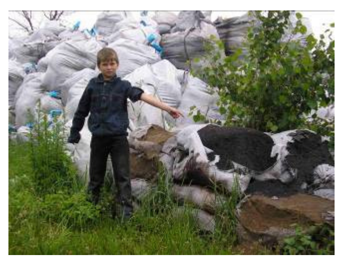
Torn chaotically dumped big bags with a hazardous substance Premix in Zakarpatya oblast (2005)