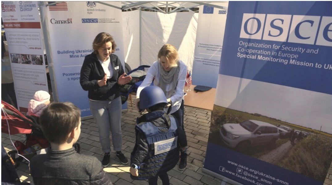
The staffs of OSCE Special Monitoring Mission to Ukraine and OSCE Project Co-ordinator in Ukraine demonstrate demining equipment during Mine Awareness Day, Kyiv, 4 April.