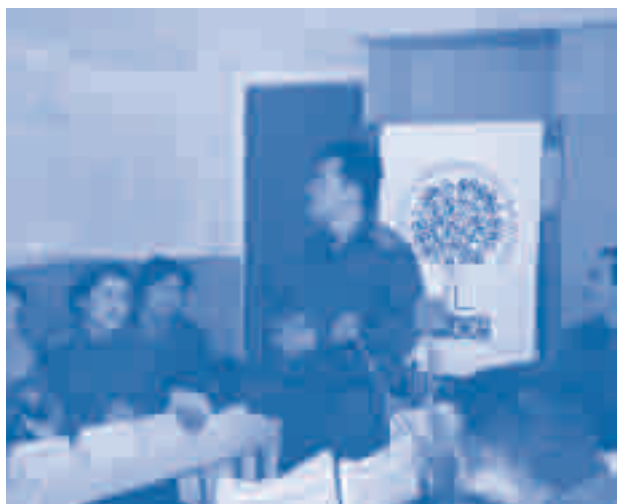
An ODIHR human rights training for prison personnel in Sugh, Tajikistan

The ODIHR and the OSCE Mission in Tajikistan supported a campaign against torture, including a pop music concert,