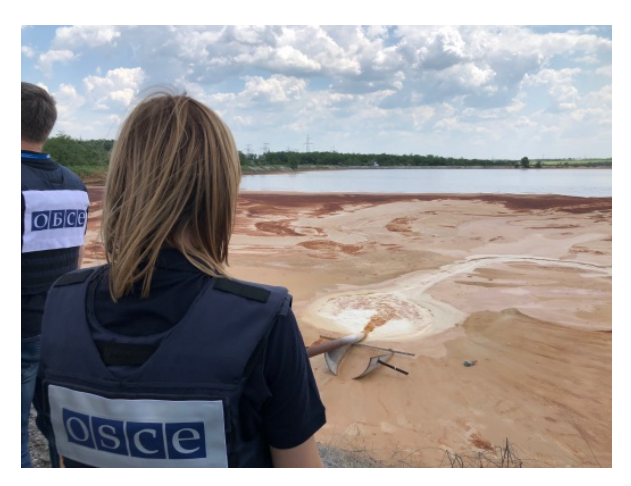
Figure 4: The SMM visits the chemical waste reservoir near the phenol plant in Zalizne, Donetsk region, June 2018

Beginning in 2016, despite requests from the Ukrainian side at the JCCC, the armed formations did not provide guarantees through the Russian Federation Armed Forces officers at the JCCC. However, following many attempts by the SMM to facilitate dialogue, the sides provided security guarantees for performing necessary maintenance and repair at the reservoir in November and December 2017, and in January, July and August 2018. An additional phase of repairs is planned for September-November 2018 continue into 2019. Throughout the reporting period, the SMM monitored adherence to the localised ceasefire in support of repair works