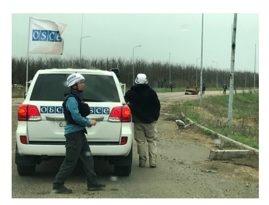
Figure 2: SMM patrol near Donetsk Filtration Station, Donetsk region, April 2017

Betmanove (former Krasny Partizan) and several districts of non-government-controlled Donetsk city. The station houses a chlorine storage facility, used for water filtration, with approximately 250 tons of chlorine stored in large tanks. If the DFS is not operational, Avdiivka and Yasynuvata are affected immediately, with the effect spreading to larger numbers of civilians the longer DFS remains non-operational. During an escalation in early 2017 in the areas of Avdiivka and Yasynuvata, the provision of potable water to 20,000 civilians in Avdiivka was suspended, and an estimated 325,000 civilians in non-government-controlled areas, primarily Donetsk city, were put at high risk of water supply shortage. SMM facilitation efforts were critical for the restoration of water supply through the resumption of operations at DFS. On several occasions in 2018, the SMM also followed up on reports that shooting and shelling impacted in the vicinity or on the territory of DFS, causing damage to powerlines and affection DFS operations. During interruptions of water provision in this area and elsewhere, the SMM observed that water is distributed by truck with the support of the Ukrainian State Emergency Services, international organizations or the armed formations.