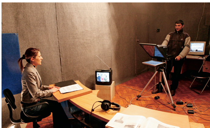
The HCNM has been helping to boost the capacity of minorities to broadcast news in their native language, one of many projects aimed at increasing the participation of national minorities in the life of wider society.

As a conflict prevention instrument within the OSCE’s politico-military dimension, the High Commissioner does not function as an ombudsperson for minorities or an investigator of individual human rights violations.