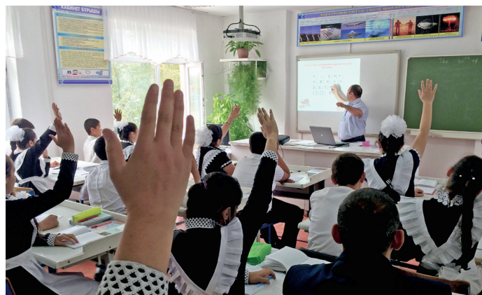
The Central Asia Education Programme promotes mother tongue-based multilingual education. It helps achieve a balance between ensuring fluency in the State language while also preserving and accommodating minority languages and identities.