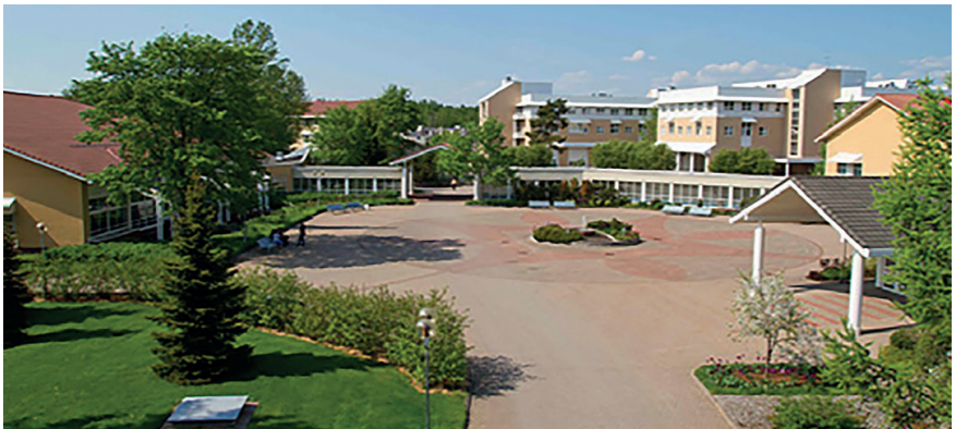
The confiscated properties in St. Petersburg: the Witnesses' national office in Solnechnoye (top left and bottom) and the Assembly Hall in Kolomyazhskiy (top right)

One of the seized properties is the former Administrative Centre in Solnechnoye, which is owned by the Watch Tower Bible and Tract Society of Pennsylvania. This property alone is valued at approximately EUR 27,027,000 (USD 30,000,000). Of the properties that have already been seized, 43 of them belong to foreign legal entities used by Jehovah's Witnesses in Austria, Denmark, Finland, the Netherlands, Norway, Portugal, Spain, Sweden and the United States. These seizures are illegal, since the Supreme Court decision banning Jehovah's Witnesses did not give the government a legal basis for confiscating foreign-owned properties.