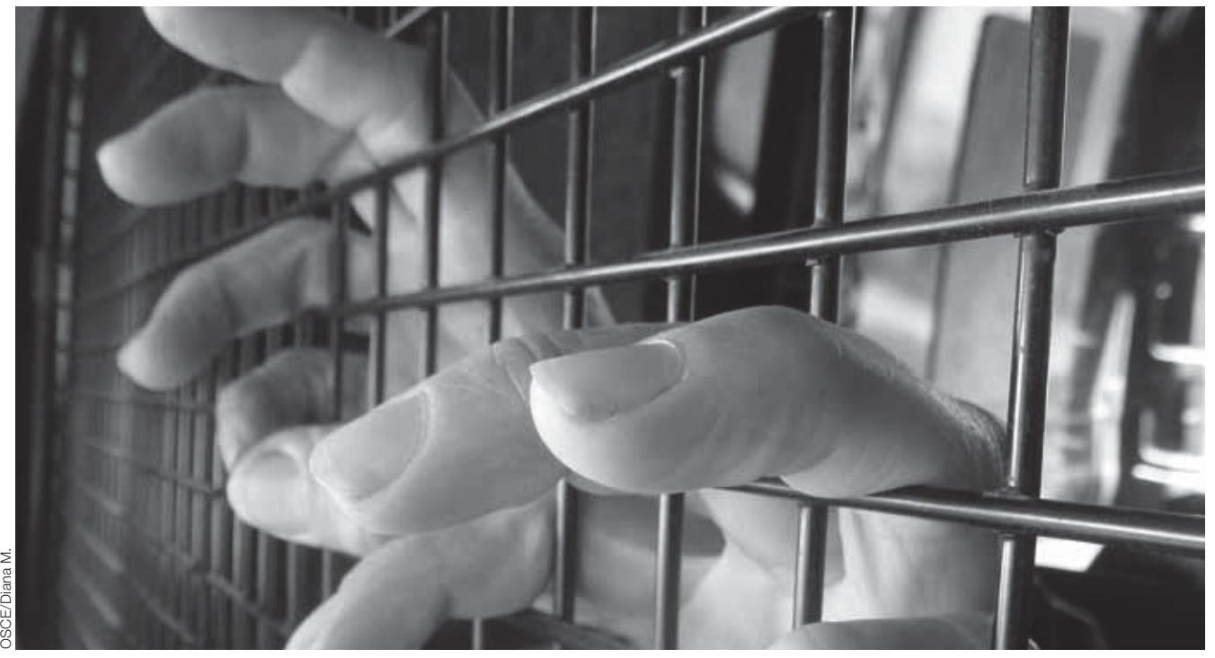
"Lack of freedom"

In 2012, the spirit of the original Alliance was maintained by engaging in bilateral and multilateral dialogue with various organizations to consolidate existing partnerships and to continue to reach out to a broad range of partners. The SR/CTHB consulted with the AECT members on current trends in anti-trafficking action and shared with them her analysis of the situation and challenges ahead. Productive discussions in the AECT helped advance a common strategic approach and renew the commitment to join efforts and secure synergies in advocacy and in field work.