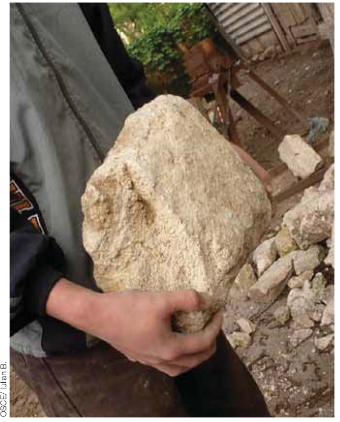
"Children are forced to work"