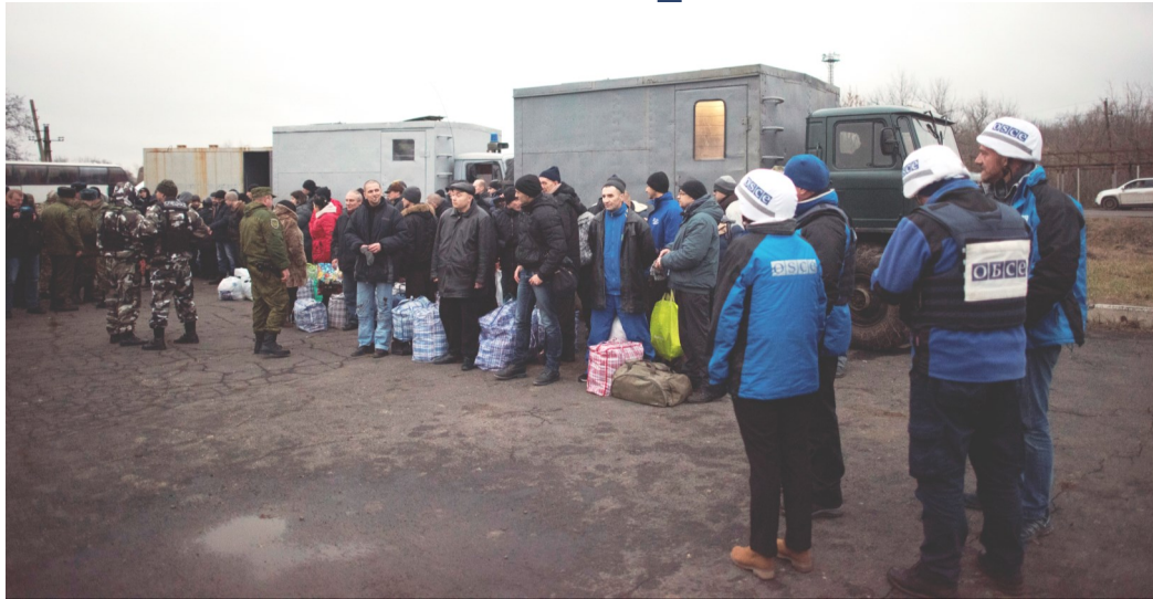
The OSCE SMM monitors an exchange of detainees on 27 December 2017.