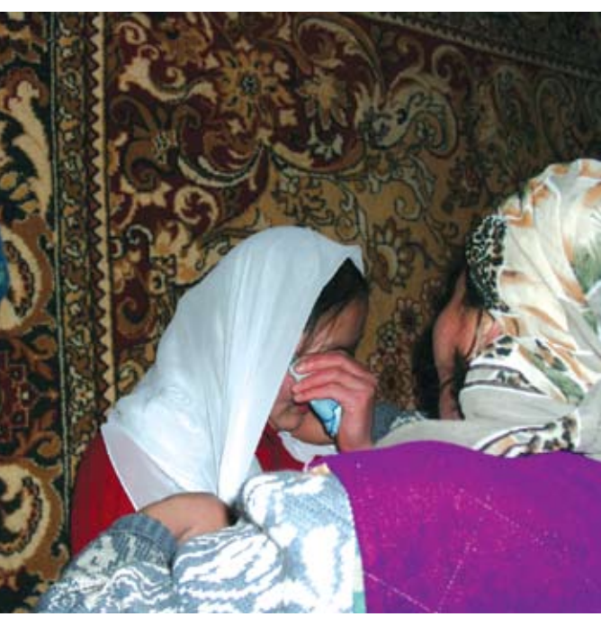
Naryn, Kyrgyzstan. A young woman weeps while being forced to wear a marriage head kerchief after being abducted.

Wanted: More studies to shed light on emerging trends