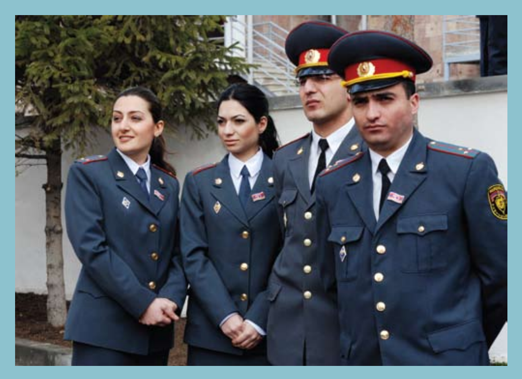
Promoting equal opportunities among male and female law enforcers and encouraging women to take active part in citizens advisory groups are key goals of the OSCE-supported police assistance programme in Armenia.