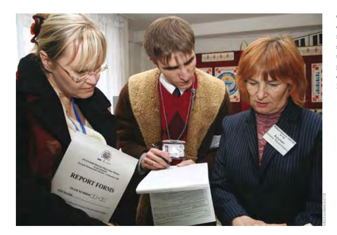
OSCE election observers fill in report forms at a polling station in Kant during the 16 December parliamentary elections in Kyrgyzstan.

post-transition countries in the OSCE region, as all participating States are equally bound by the 1990 Copenhagen commitments, and therefore should periodically review their procedures to ensure best electoral practice.