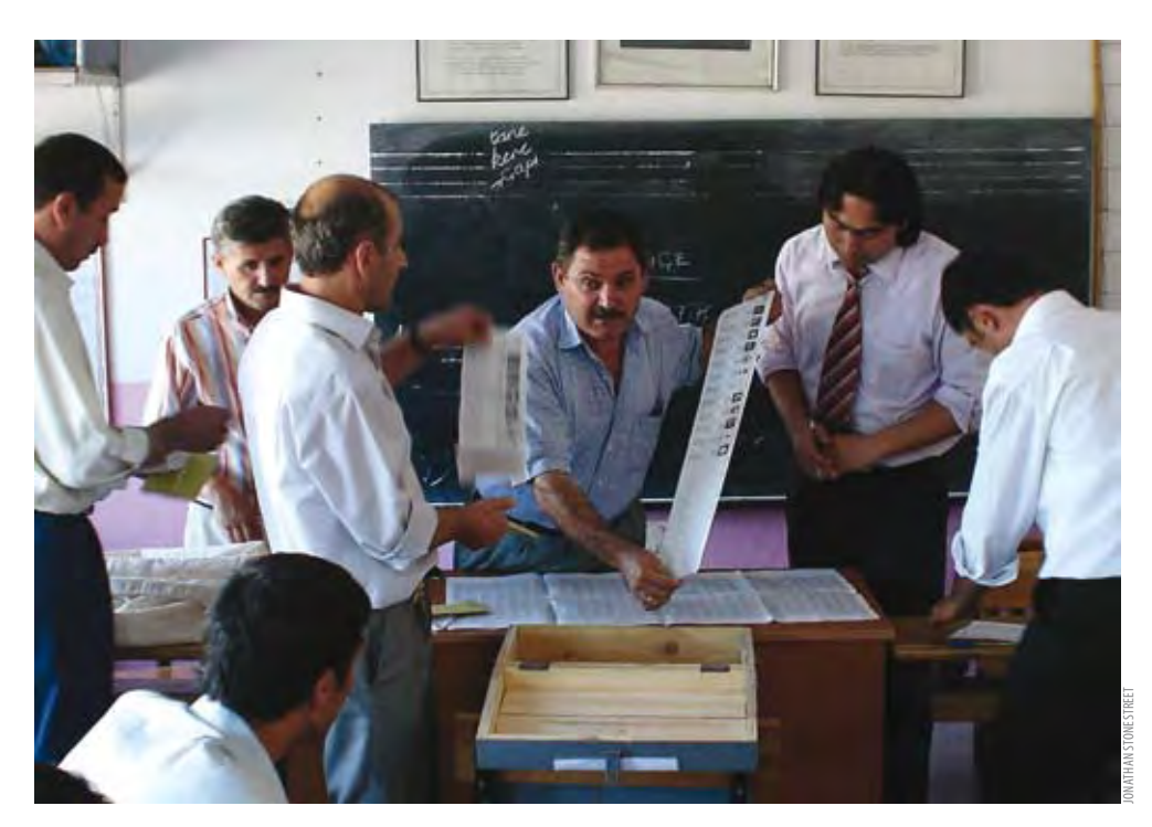
Polling-station officials count ballot papers in the 22 July parliamentary elections in Turkey.