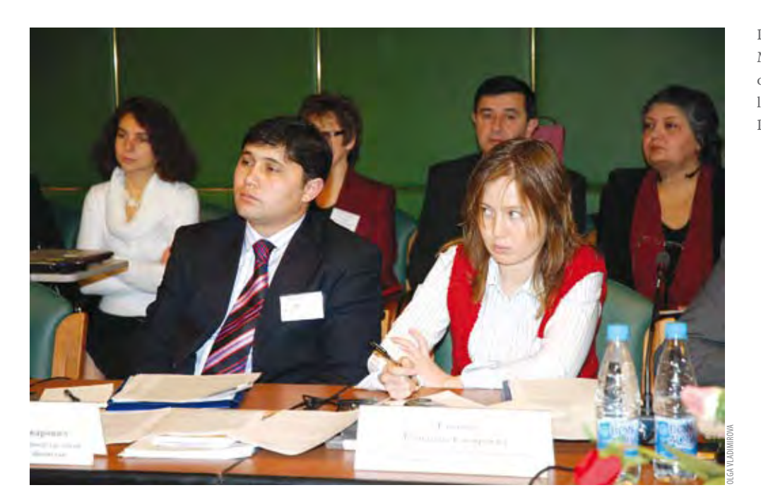
Participants at a Moscow conference on new immigration legislation in the Russian Federation.

In co-operation with the OSCE Presence in Albania, ODIHR assisted the Albanian Government with its planning of the modernization of the population registration and address systems. The resulting planning document provided the basis for a technical-assistance project by the OSCE Presence that started in 2007 and will continue into 2009.