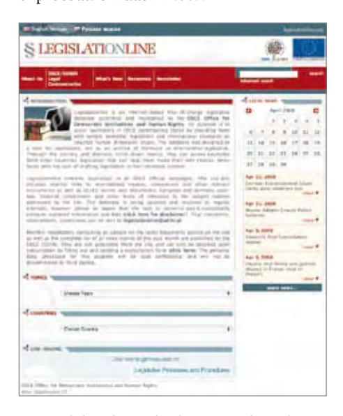
ODIHR's legislative database, Legislationline, is available at www.legislationline.org.

Follow-up activities are currently under discussion with Georgia's Justice Ministry, and ODIHR has further updated its assessment report for Georgia. An assessment was conducted in the former Yugoslav Republic of Macedonia in 2007 upon the request of the authorities. A report was presented in December. Follow-up activities to support the recommendations in the report are planned for 2008. An assessment is planned for 2008 in Moldova, following amendments to the parliamentary rules of procedure made in 2007.