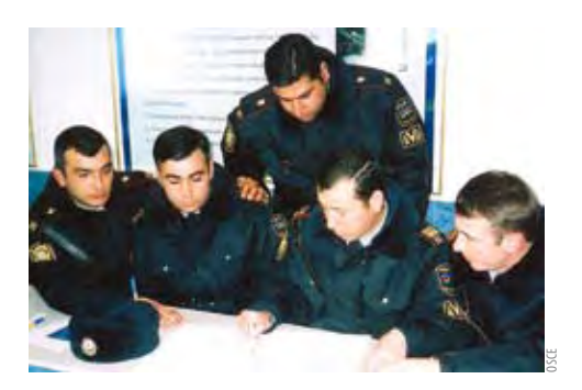
Azeri police officers discuss domestic violence at a training course at the police academy in Baku.

In Armenia, for example, ODIHR provided expertise and financial assistance to the Association of Armenian Women with University Education to conduct a series of training workshops on political and civil rights, public participation, political party development, and electoral issues