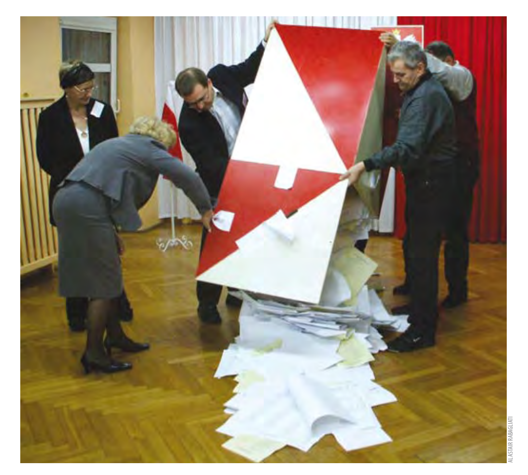
A ballot box is emptied for the count at a polling station in Warsaw during the 21 October parliamentary elections in Poland.

19 participating States that may not be in a position to regularly second observers.