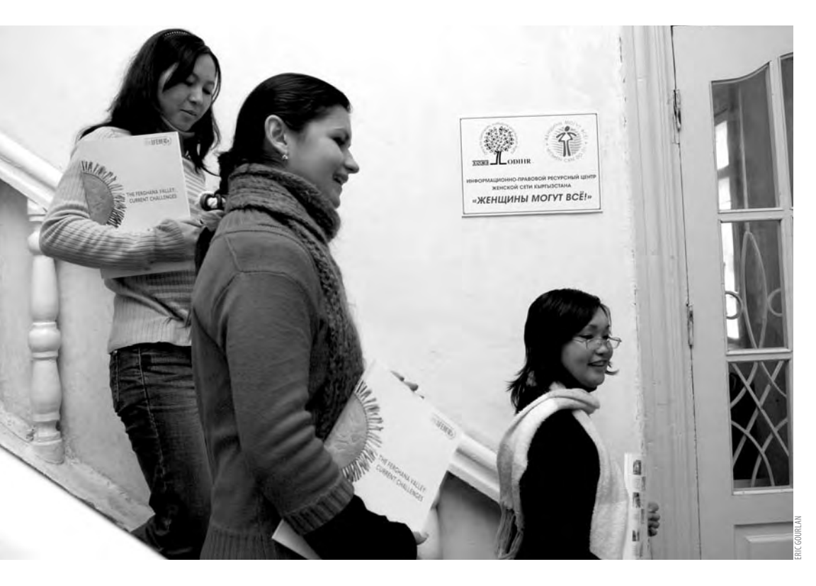
Participants from regional networks in Azerbaijan and Kyrgyzstan attend a workshop on women's leadership in Bishkek in April.

the Law on Protection of Victims of Domestic Violence, adopted by Georgia's Parliament in May 2006. Overall, some 150 police officers took part in the training. In addition, ODIHR continued to assist the Network in operating a crisis centre and a shelter for victims of domestic violence. This included provision of expert assistance on methods of victim rehabilitation and the development of legislative initiatives related to victim protection and rehabilitation issues.