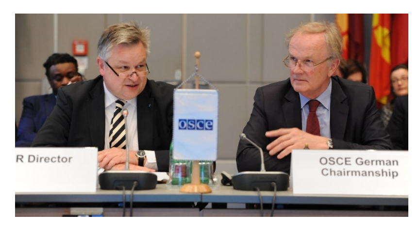
Director Link (l), and Ambassador Eberhard Pohl, 2016 Chairperson of the Permanent Council, opening the OSCE Suplementary Human Dimension Meeting on Countering intolerance and discrimination, Vienna, 14 April 2016.

Promoting tolerance and effectively countering discrimination are vital to ensuring security, and must be at the centre of policies to address current threats, participants said at the opening of a two-day OSCE human dimension meeting in Vienna on 14 April.