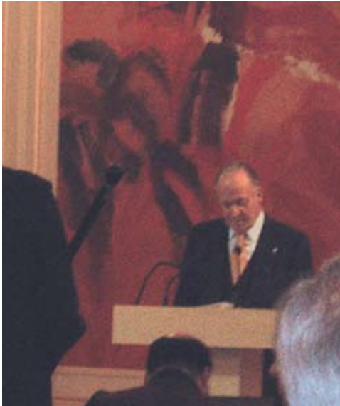
King Juan Carlos I of Spain speaks at the inauguration of the OSCE Secretariat's new headquarters, 21 November 2007.