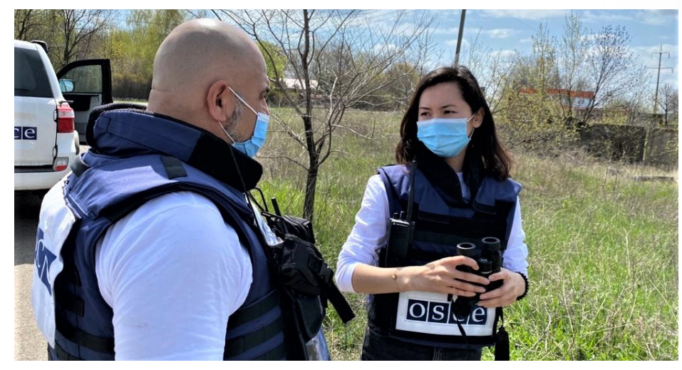
SMM monitoring officers in Horlivka, Donetsk region