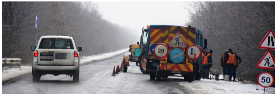
An SMM patrol on the road in Donetsk region