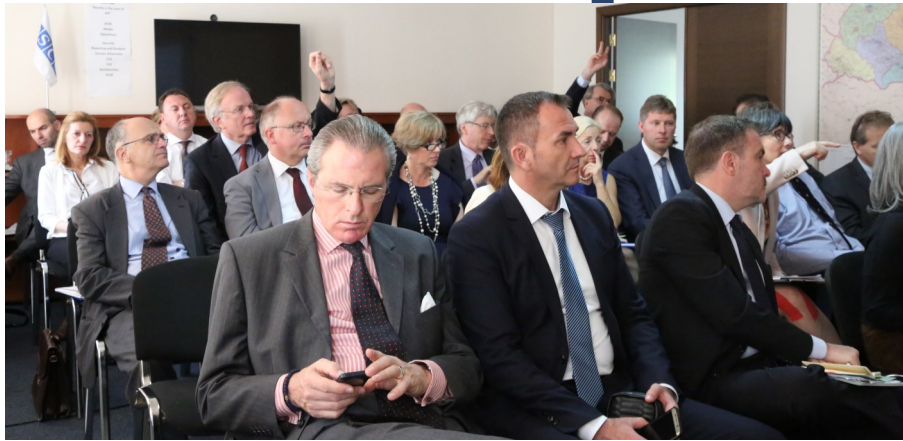
SMM hosts 27 Ambassadors to the OSCE in Kyiv, 29 May 2017