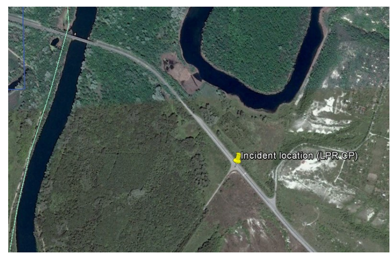
SMM patrol caught in fire in Shchastia on 26 July 2015, but comes out unharmed