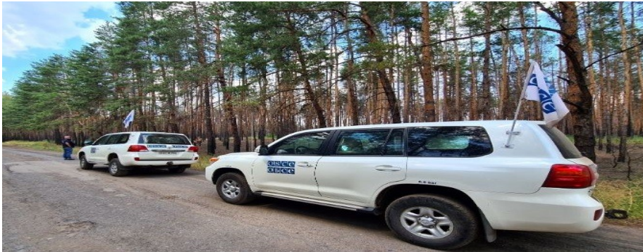
SMM patrol near Trokhizbenka, Luhansk region