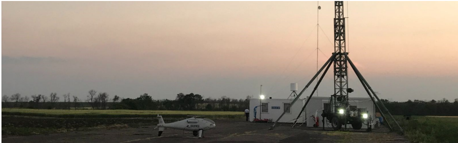
SMM long-range UAV base in Stepanivka (OSCE)