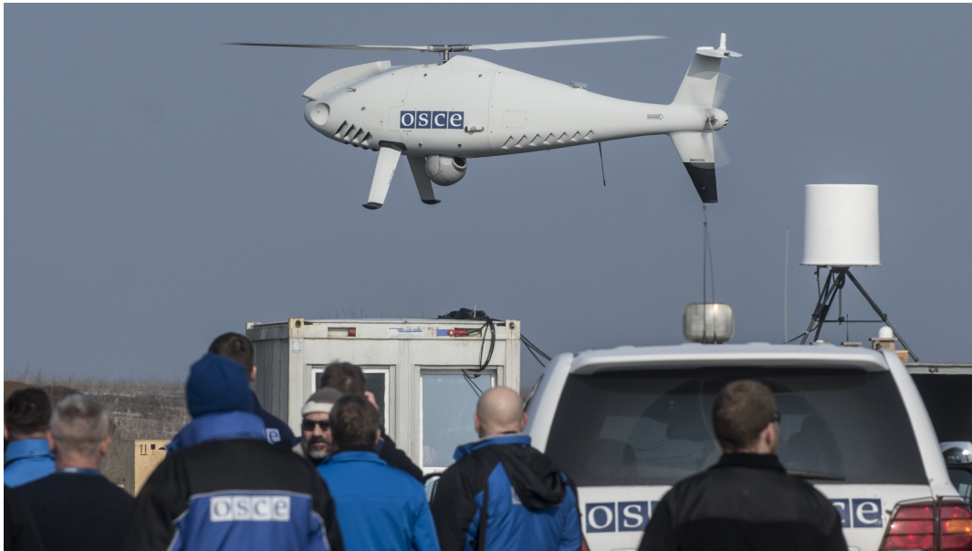
The OSCE SMM launching the long-range unmanned aerial vehicle near Kostiantynivka in Donetsk region, 28 March.