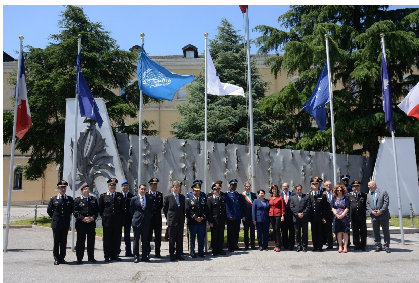
High-level authorities participating in the launch event