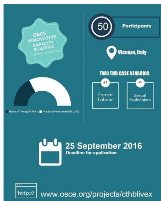
Chart posted on Twitter to share the call for participants