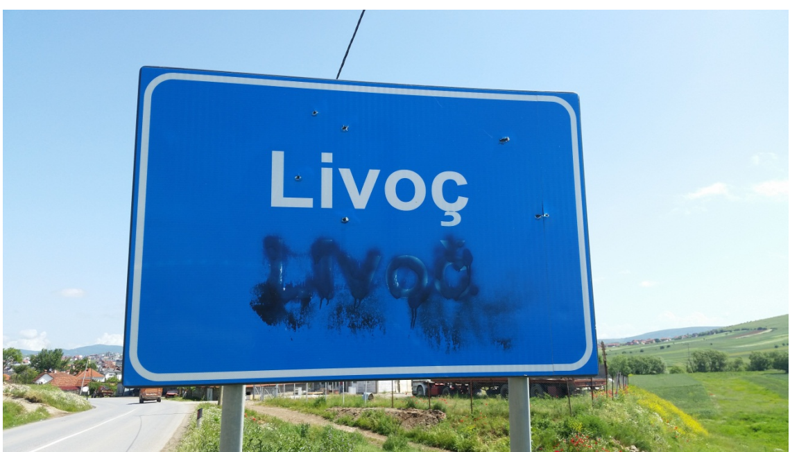
Road sign in Gjilan/Gnjilane municipality, 28 May 2014

Municipalities remain unable to fully implement the Law on the Use of Languages due to the fact that they remain largely understaffed with respect to interpretation/translation services. An insufficient number of translators, inadequate qualifications and inadequate working conditions often lead to poor quality translations. Municipal translation units should be established throughout Kosovo with qualified staff and adequate working conditions. The Kosovo Institute of Public Administration should play a key role in enhancing the proficiency of interpreters and translators within the civil service.