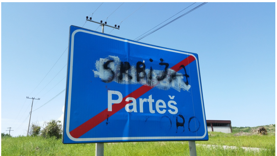
Road sign in Parteš/Partesh municipality, 28 May 2014

the municipalities do not ensure translation of meeting minutes. Furthermore, half of the municipalities fail to comply with their obligation to issue all municipal legal drafts and legislation in all official languages as well as to ensure adequate quality of those translations. Municipalities should increase human and financial resources to ensure interpretation during public meetings and adequate language translation of all official documents.