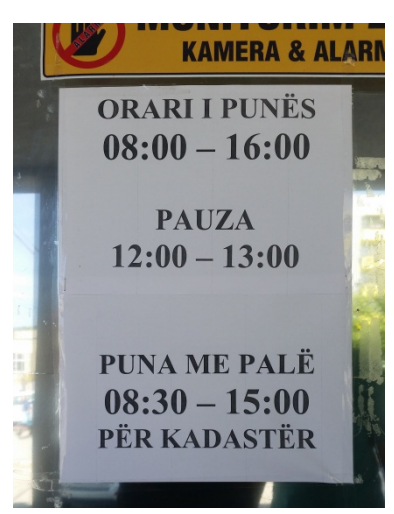
Entrance door sign in Gjilan/Gnjilane municipality, 28 May 2014

The OSCE's regular monitoring indicates that the main reasons for not adopting the practice of displaying multilingual municipal signs were a general lack of political will and a lack of full understanding of the obligation.