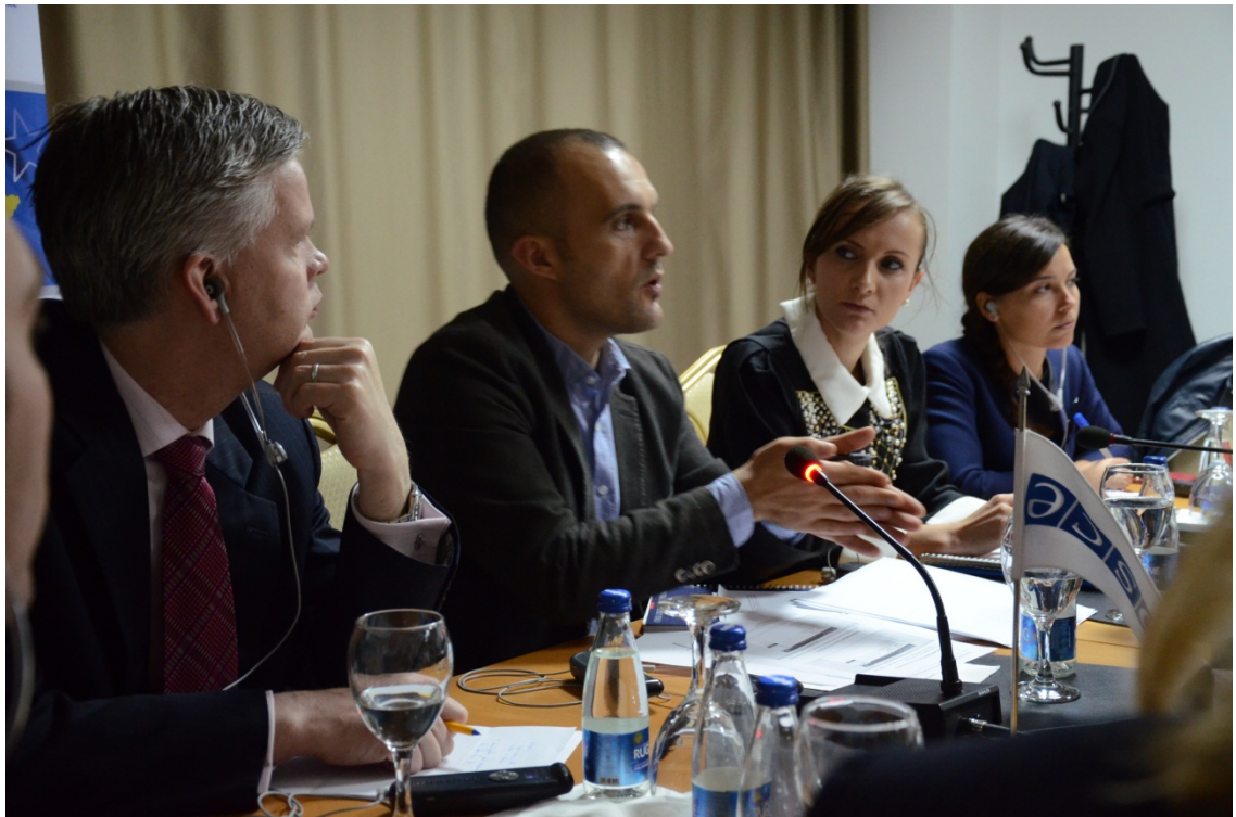
Language Commissioner Slaviša Mladenović presents at a workshop on municipal language compliance organized by OSCE in Prishtinë/Priština, 17 October 2013