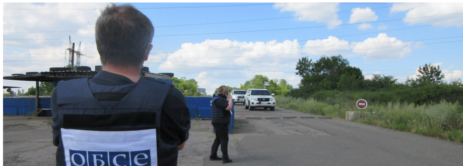
Monitoring officers in the vicinity of the disengagement area near Zolote in Luhansk region