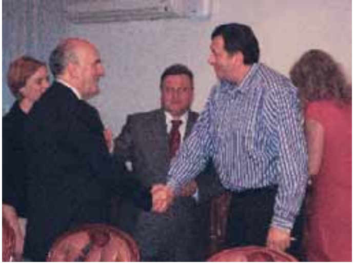
HOM, accompanied by Ambassador Aleksandar Dragičević, meets the Prime Minister of Republika Srpska, Milorad Dodik, 14 May 2007