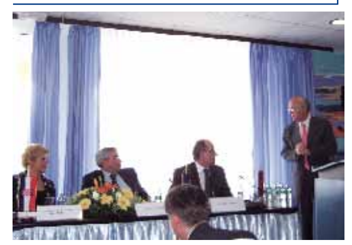
HOM adressing the three Ministers of Foreign Affairs from Croatia, Kolinda Grabar-Kitarović, from B&H, Sven Alkalaj and from Montenegro, Milan Roćen, moments before they signed the joint statement on cross-border co-operation, Neum 21 May 2007