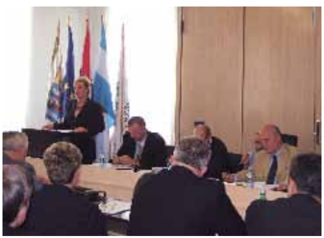
Foreign Minister, Kolinda Grabar-Kitarović adresses Vukovar County Prefects, Mayors, NGOs, minority representatives and HOM during the "Plenary in the Field" in Vukovar, 21 May 2007