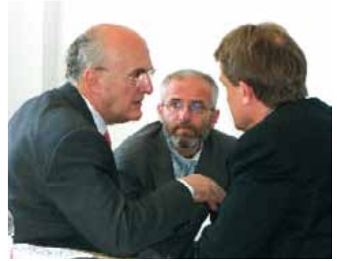
HOM and Development Minister, Božidar Kalmeta, at a "Plenary in the Field" meeting in Benkovac, 18 May 2007