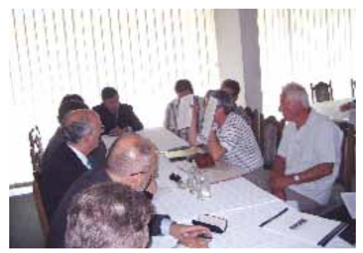
Croatian Serb refugees, former civilian workers of the JNA and OTR holders, presenting their issues to the group of Ambassadors, Hotel Krajina,14 May 2007