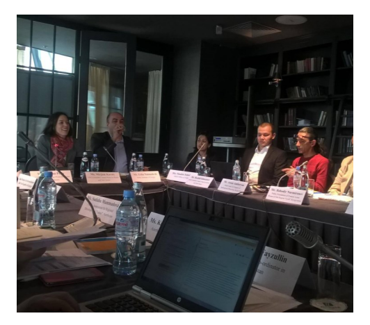
Participants exchanging expertise and experiences at the meeting in Tbilisi.

On 18 May, the ODIHR Contact Point for Roma and Sinti Issues organized an international consultation meeting in Tbilisi on the situation of Roma and related groups in the South Caucasus and Central Asia.