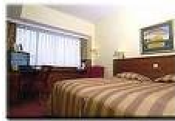
Tulip Inn Brussels Boulevard

The hotel is situated at Place Rogier. Within walking distance from the famous Grand Place with its Manneken Pis, and the main shopping area. Easy access to metro, main train stations as well as the Brussels Ring.