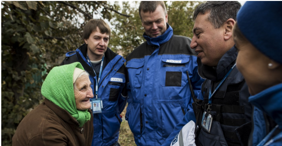
OSCE SMM monitors meeting residents of the village of Pisky, Donetsk region, October 2015.