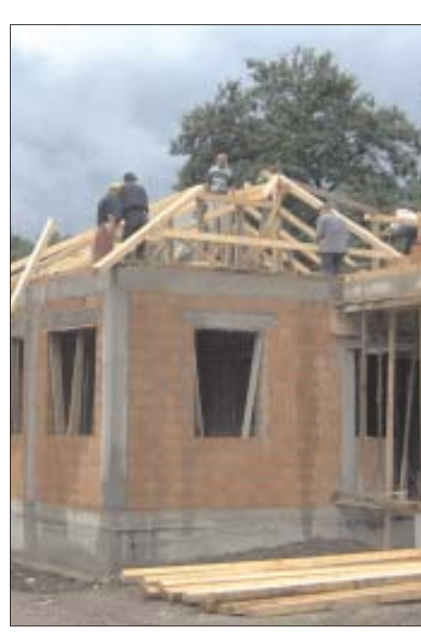
Workers\ building\ the\ roof\ of\ the\ Ambulanta

The practice shows that when people agree between themselves, solutions come quick. Although building the ambulanta took approximately one year, the result is impressive. At least for the 3,500 inhabitants of Livoç i epërm/Gornji Livoč, who in the near future will not have to travel to the nearest city - which is not very close - to get medical treatment.