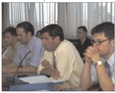
Local and international experts, during the session held in the OSCE Mission Headquarters in Prishtina

ence included other stakeholders and opinion makers as well. A local expert, who greatly added to the local ownership of the debate, chaired all three sessions. A number of other local organizations participated and were active in various panels.