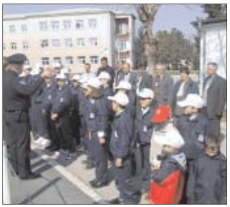
Junior KPS Officers and Primary School Children visiting the KPSS

In addition, they had the chance to talk to many Serb cadets who expressed their satisfaction with the life and the work being done at the KPSS. The cadets emphasized that the school should be taken as an example throughout Balkans on how members of different ethnic communities can work, study, live and have fun together.