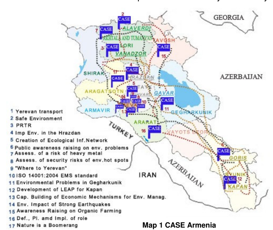
Table 1 shows that projects so far supported under CASE Armenia offer an eclectic mix of activities and cover most of the priorities identified by the country strategy. In short, projects

selected so far provide good fit to the environmental challenges facing Armenia. Looking at the regional distribution of projects, the attention paid by CASE Armenia to having a balanced regional representation of projects becomes apparent. This illustrated by Map 1. While project activities concentrated are around the major environmental hotspots (industrial and mining centres) such as Alaverdi. Hrazdan and Yerevan. adequate attention is being paid to support civil society