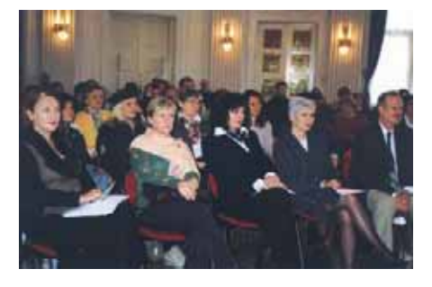
The Mission supported the Women's Network Croatia ceremony aiming to present the "Maja Miles Award" to two female journalists for gender sensitive journalism in honour of the 8th March, International Women's Day in the Journalists' House in Zagreb.

"The Awards for Gender Sensitive Journalism" was implemented by the Women's Network Croatia (WNC), in Zagreb in March 2006 with Mission funds of € 1,563.