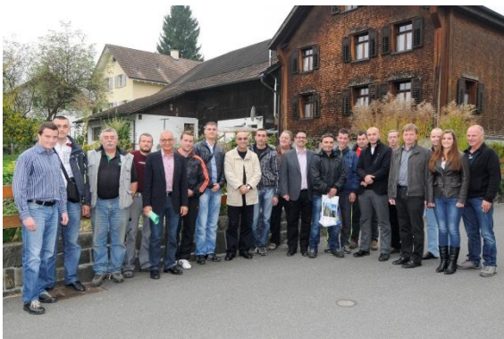
Agricultural trainees from Bosnia and Herzegovina in Liechtenstein

Bosnia and Herzegovina has been a priority country for many years. Since 2004, more than CHF 4.6 million was spent for the integration of minorities and education. Also, projects to strengthen the rights of women were implemented. A migration partnership with Bosnia and Herzegovina exists since 2011, which includes projects of circular migration. Young farmers from Bosnia and Herzegovina are given the opportunity for a one year training in the agricultural sector in Liechtenstein. The project aims to strengthen the transfer of knowledge.