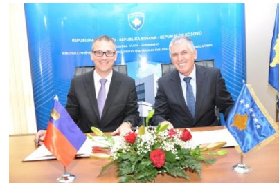
Former Liechtenstein Minister of Interior, Hugo Quaderer, with Minister of Interior of Kosovo, Bajram Rexhepi, in 2012

Since 2007, Liechtenstein has supported projects in Kosovo with CHF 2.8 million . The projects focus on the integration of minorities such as Roma and Sinti, the improvement of educational infrastructure as well as rural development. In 2012, Liechtenstein and Kosovo agreed on a migration partnership.