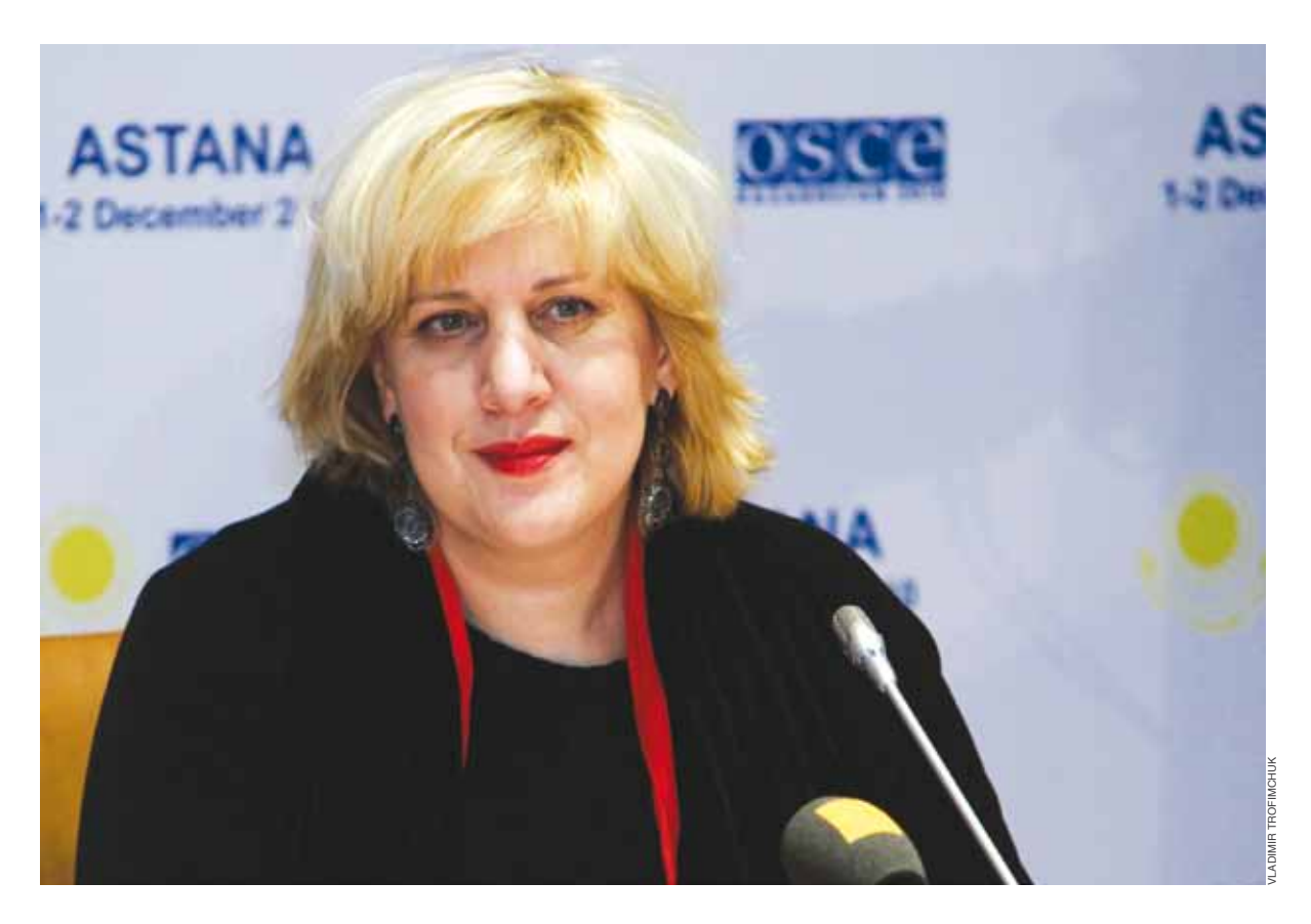
INTERVIEW WITH THE OSCE REPRESENTATIVE ON FREEDOM OF THE MEDIA, DUNJA MIJATOVIĆ