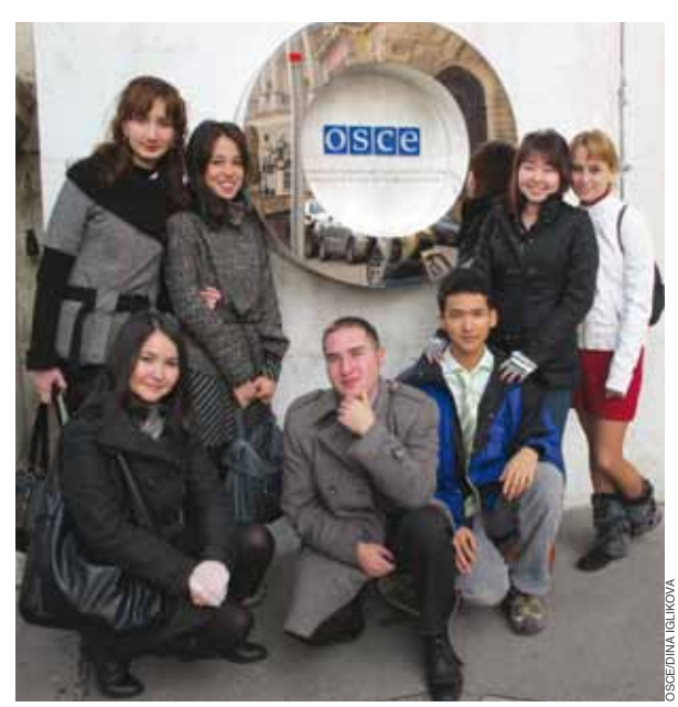
Winners of the CAYN research paper contest pose for a photo during their trip to Vienna, October 2010.

Three months passed quickly, and at the end of September we again gathered in Almaty to share our research findings. The room was charged with excitement as we presented our