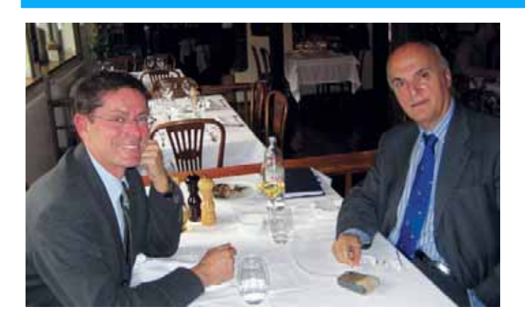
Ambassador Fuentes invited for an introduction lunch the newely appointed Minister of Justice, Ivan Šimonović, Zagreb, 16 October.