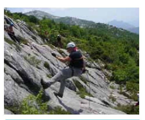
an incredibly hot place to be in summer but a good place to learn absail techniques usefull for anyone who loves the outdoors.

Last years have seen an increase in what is called Adventure Tourism in Croatia and it is only natural that proportionally the number of interventions has increased with that. During its existence, the HGSS searched for, rescued, aided or participated in operations with other services to the benefit of thousands of persons, a large proportion of which were foreign nationals. The HGSS personnel work is a major contribution to the overall safety of the country and a great promotion of what Croatia has to offer.