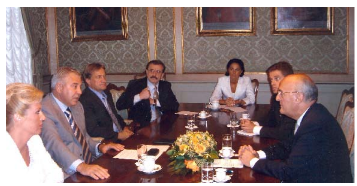
Prime Minister Ivo Sanader and close associates speak with the OSCE Mission to Croatia Head, Ambassador Jorge Fuentes on fulfillment of the remaining issues of the Mission's mandate, 8 September 2006. (Photo by: Minister of Culture, Božo Biškupić, who also attended the meeting.)