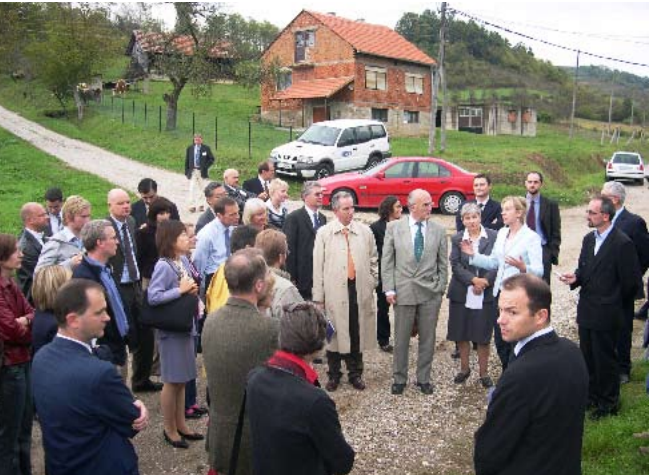
Almost 40 Ambassadors and representatives of OSCE Embassies in a visit to the Sisak Field Office on 5 October 2006.