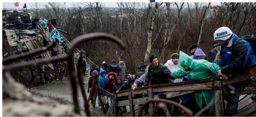
An OSCE SMM monitor helps people to cross the bridge in Stanytsia Luhanska, 21 November 2017.