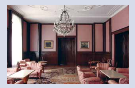
Ground Floor Salon

The New Court was an official residence of King Aleksandar Karadjordjevic in the period between 1922-1933 after which the Court was given to the National Museum upon the King's wish. The Museum occupied the premises in June 1934. The Museum collections remained in the New Court until 1948 when the building was taken over by the Executive Council of Serbia.