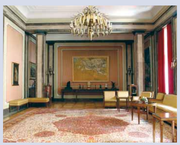
The Yellow Salon appearance to the entrance and the façade facing Kralja Aleksandra Boulevard.

The significant changes of the Old Court building were made during its postwar reconstruction in 1947, which gave the Court a new function, but also a new