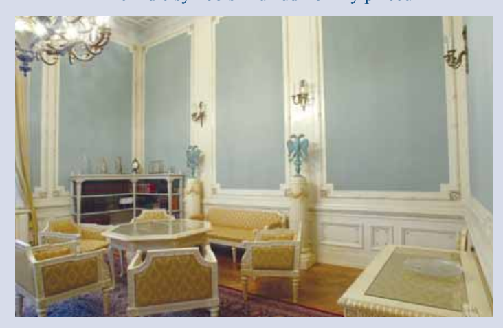
The Diplomatic Salon

The programme of the interior design of the parliamentary building included special emphasis on the representative premises, big and small halls, halls for sessions and officials' offices. The decorative marble floor contributes to the festivity of the central vestibule overtopped by a dome, along with the polychromous walls with pillars, pilasters, niches and galleries. The heraldic symbols and additionally placed