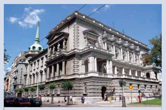
The Belgrade City Hall- historical view

► The Old Court, presently the Belgrade City Assembly, was built between 1881 and 1884 according to the design of the architect Aleksandar Bugarski, as a private and official residence of Milos Obrenovic, the King of Serbia from 1882. The Old Court is one of the most sig-