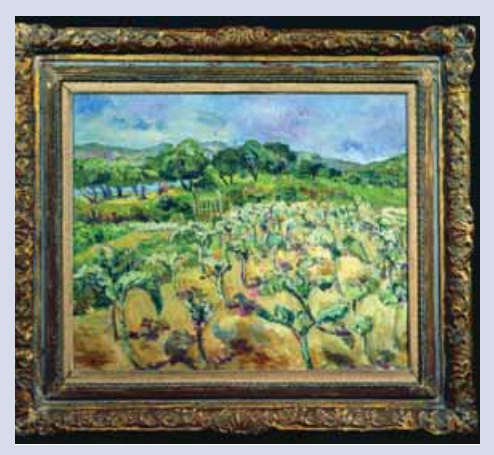
Kosta Hakman, "Landscape with Olive groves", 1938.

any anthological overview of art, both in our country and in the former Yugoslavia.