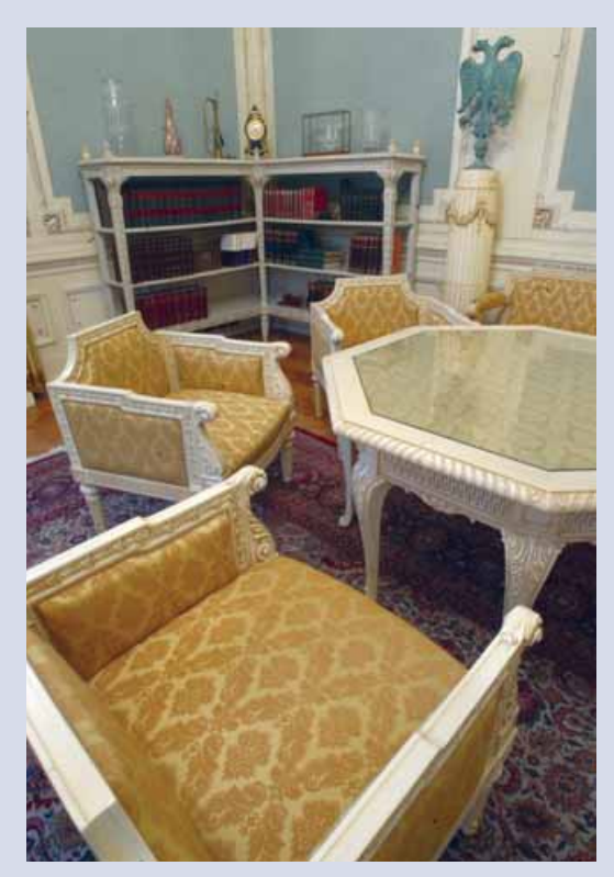
The Diplomatic Salon

sculptures of the rulers attribute a symbolic character to this space. A large hall, known as the "talks hall" represents the central parliamentary room, which is ornamented by rich plaster decoration and engraved furniture.