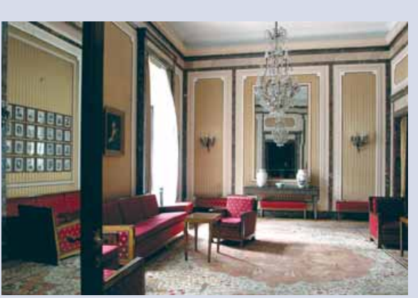
The Red Salon

Today, the Court interior is decorated by numerous works of domestic painters and sculptors. In the Red Salon there is a