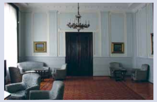
Ground Floor Salon