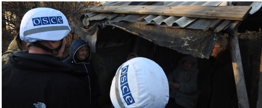
SMM monitoring officers in Zolote, Luhansk region