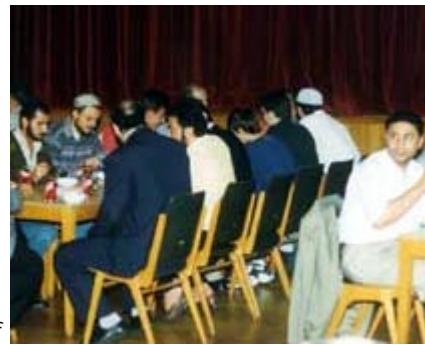
Austrian Muslims have iftar

The Muslim community, almost 350,000, finds it a piece of cake to live the religious atmosphere of Ramadan, especially when Islam is recognized as an official religion in Austria.