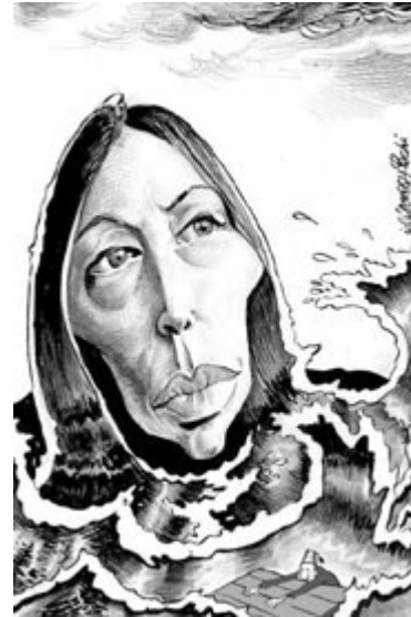
"Mrs Fallaci is insulting the Muslim community as a whole with her shameful words," the head of Geneva 's top Islamic center said.

Fallaci, 72, is one of Italy's best-known journalists and now lives in New York, where she witnessed the September 11 attacks.