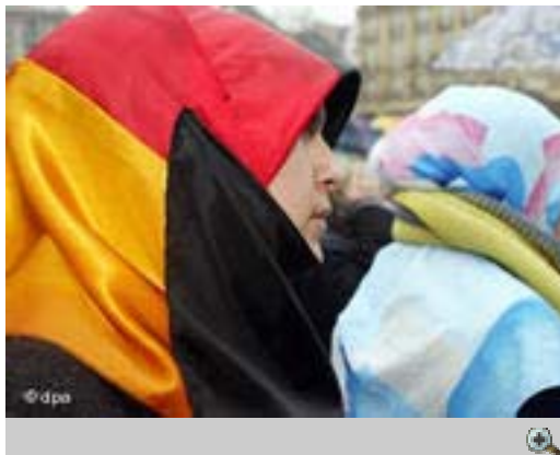
Showing allegiance to Germany

http://www.dw-world.de/dw/article/0,1564,1513012,00.html