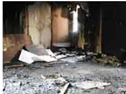
A file photo for a mosque in the Netherlands that suffered an arson attack.

Even before the November killing of anti-Islam filmmaker Theo Van Gogh, following his insulting documentary about Islam, Dutch Muslims have been targeted by the extremist agenda of the influential right-wing parties.