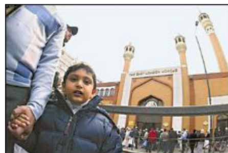
A library photo of Muslims leaving East London Mosque, which is Europe's biggest Muslim community center

Standing up strongly to xenophobic ideologues and the Zionist lobby, proving that they are really a heavyweight community and earning the respect of government officials and MPs are