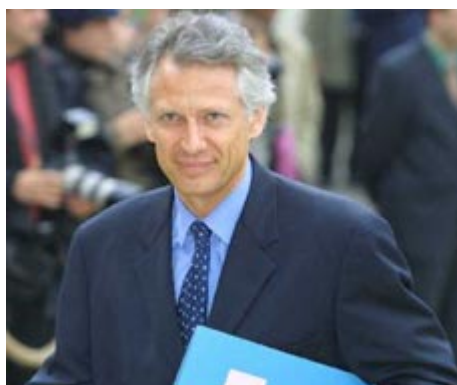
De Villepin pressed for teaching imams French history and culture

At recommendations from French Interior Minister Dominique de Villepin, imams are now required to study a miscellany of subjects on Islam and the history of secularism in France as a part of a government initiative to help train them.