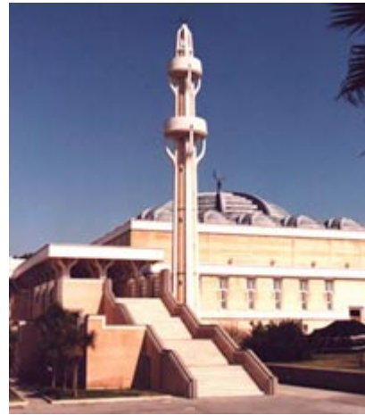
The grand mosque in Rome.

The government has taken the initiative and formed a Muslim consultative panel to discuss the affairs of the community to the outrage of the right-wingers, who criticized the cabinet for its “lenient” stances toward “Muslim terrorists.”