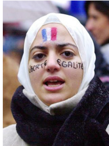
We cannot ignore the distinctiveness of the Muslim community in France

To think or believe that the "forward-looking" gaze-secularism, pluralism, freedom of expression and their sisters from the same modern plane-will enable us to ascend to a man-made utopia has systematically become an academic trance; what has happened to such axioms? Are they becoming mirror images of their medieval opposites? All mainstream religious peoples, non-Muslims as well as Muslims, are getting more and more tribally quarantined by secular forces, equal in absolute values, to that of the unenlightened dogmatists-those of the "backward gaze." In fact, the fundamentalists within them-in all beliefs-are making things even worse for them.