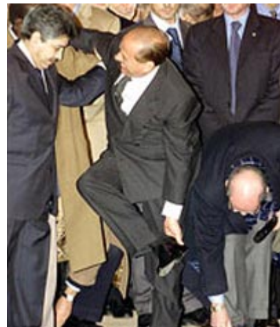
A file photo of Berlusconi taking off his shoes before stepping in a Rome mosque.

Senegalese-born imam Abdel Qadir Fadlallah Mamour had been deported "for disturbing public order and being a "danger to state security" after expecting attacks on Italian troops serving in Iraq.