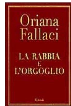
"The Rage and The Pride": "a work that concentrates hate against Muslims"

Anti-racist group, MRAP, had called for a ban on the book. Two other rights groups, the International League Against Racism and Anti-Semitism (LICRA) and