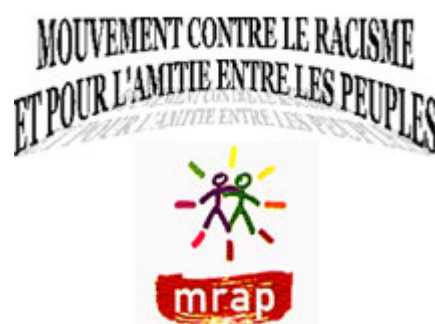
Fallaci's "Anger and Pride" is an "incendiary tract of Islamophobia," said MRAP in its plea.