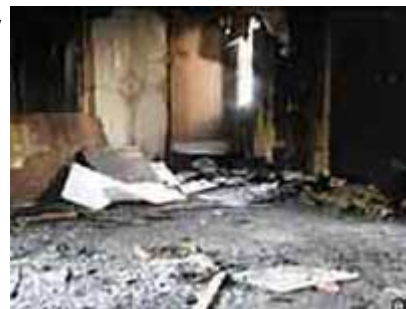
A file photo of an attack on a mosque in the Netherlands.

Orhun recommended that Islam should not be politicized by countries that are home to Muslim