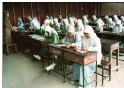
Female Muslims in Austria encounter no hijab