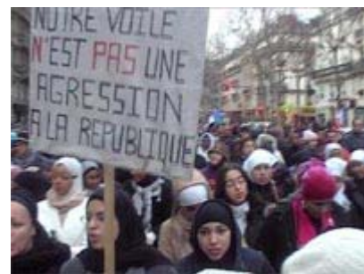
There is a call prevalent in Western Islamic circles to set a clear fiqh for minorities

Thousands of veiled women appearing before the head of one of the Islamic organizations, in a conference for the Islamic Organizations Union (April 2003), clearly showed that the Islamic wave, which had been stopped before in Tours in southern France, is continuing today and has not only reached Paris, but Brussels too, the capital of the European Union. Doesn't this give the French the right to suspect the intentions of the Islamic associations working in France and to suspect their aspirations in Islamizing France?