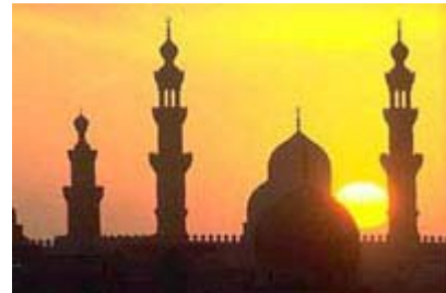
A view of al-Azhar of Cairo, one of the Islamic world's oldest intellectual institutes and centers of Islamic learning