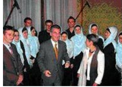
Fischer joined Muslims in celebrating the silver Jubilee of the Islamic Religious Authority in Austria.

VIENNA, January 4 (IslamOnline.net) – The Muslim community in Austria shined in 2004, showing great ability to integrate smoothly into the Austrian society, making use of the official recognition of Islam as a the second state religion, allowing Muslims to defend their rights, in addition to being staunch supporters of Arab and Islamic causes.