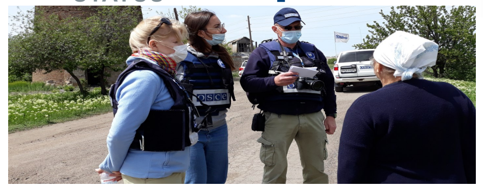
Monitoring officers speaking to a civilian in Starohnativka, Donetsk region