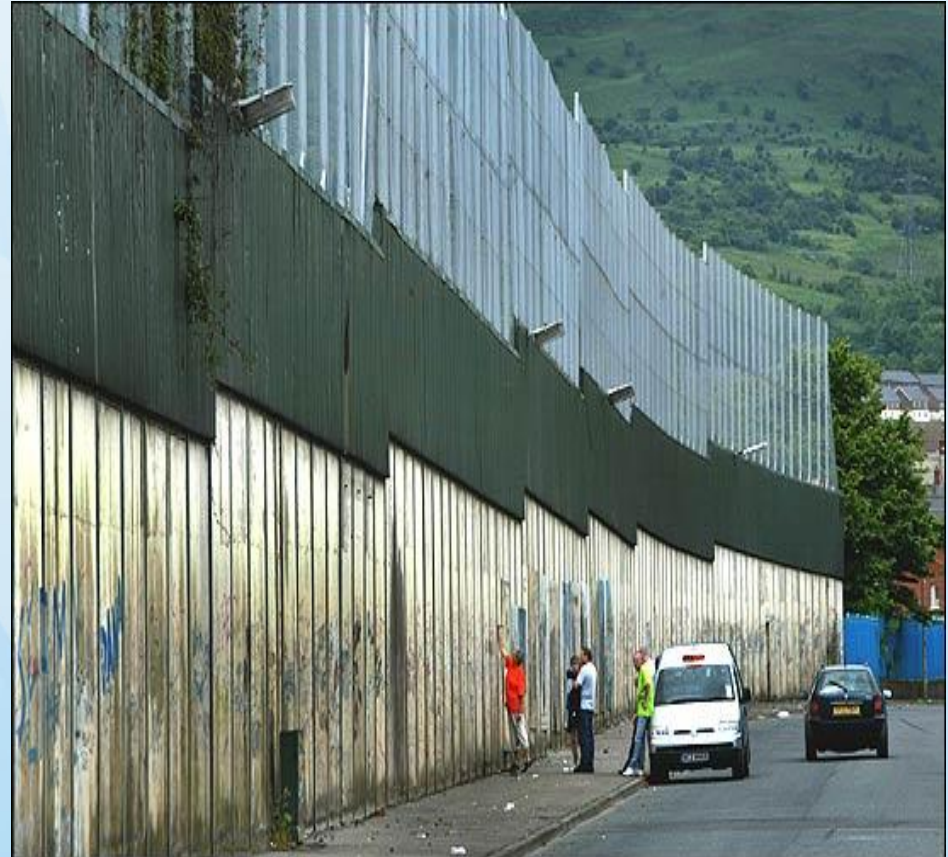
Community Interface area, North Belfast