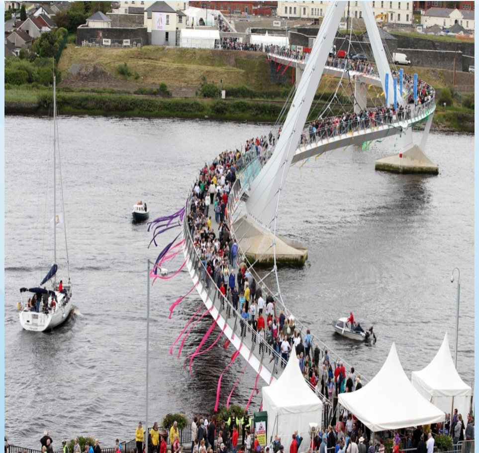
Peace bridge, Derry-Londonderry