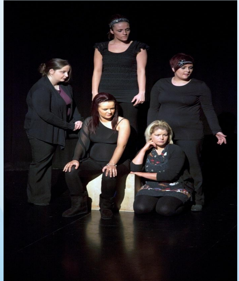
Participants perform a play recounting their experiences of the conflict