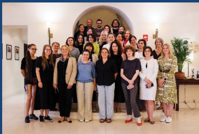
Study visit participants with ODIHR hosts on the first and second day of their exchanges