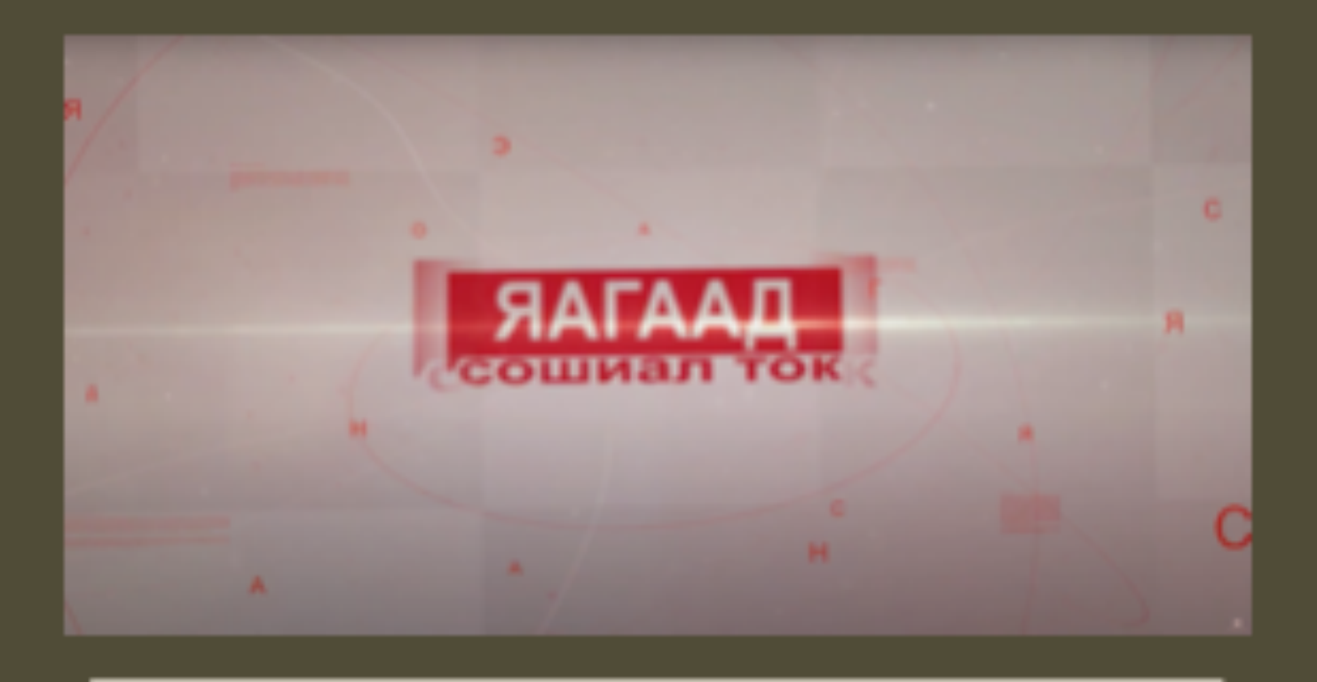
The Why Social Talk