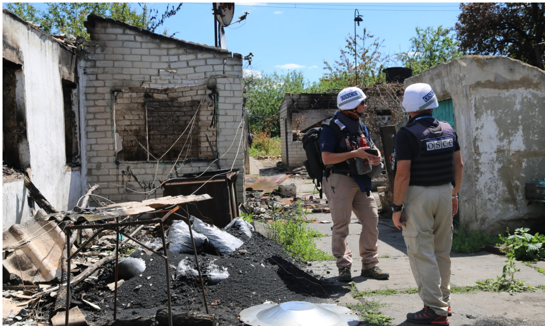
OSCE SMM monitors observing damage in Chyhari, Donetsk region, 7 June 2018.