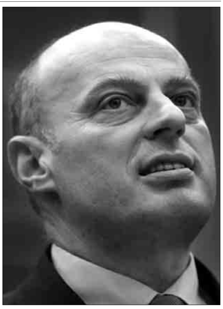
Prime Minister Agim Çeku

Kosovo's citizens will be at the center of our work and actions. As a government, we will be open for all our obligations, facing the challenges of governing while keeping in mind that we will be held accountable for our work in