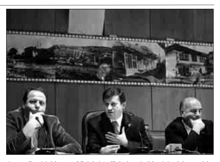
Ismet Beqiri, Mayor of Prishtinë/Priština, in Municipal Assembly

UNMIK's Office of the SRSG relies on the strong field presence to remain appraised of compliance with Standards implementation and implement an accountability policy. Persuading PISG offi-cials to act in accordance with their responsibilities, competencies