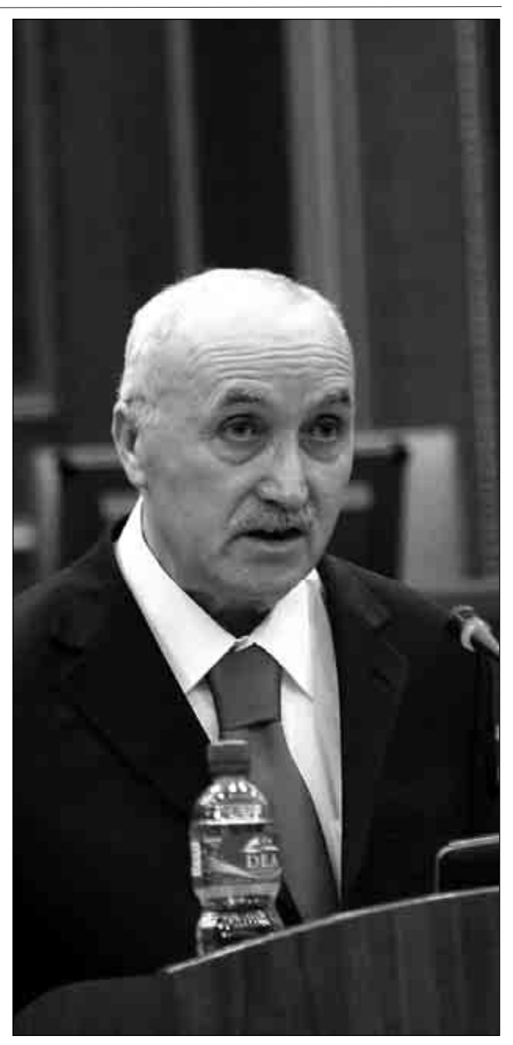
Assembly President Kolë Berisha

Being the first among the equal members of this house, apart from my continuous efforts for creating better conditions to conduct normal work and to tackle eventual individual problems of each Assembly member but of all common problems too (needless to say, as much as the circumstances permit us), I will also do my