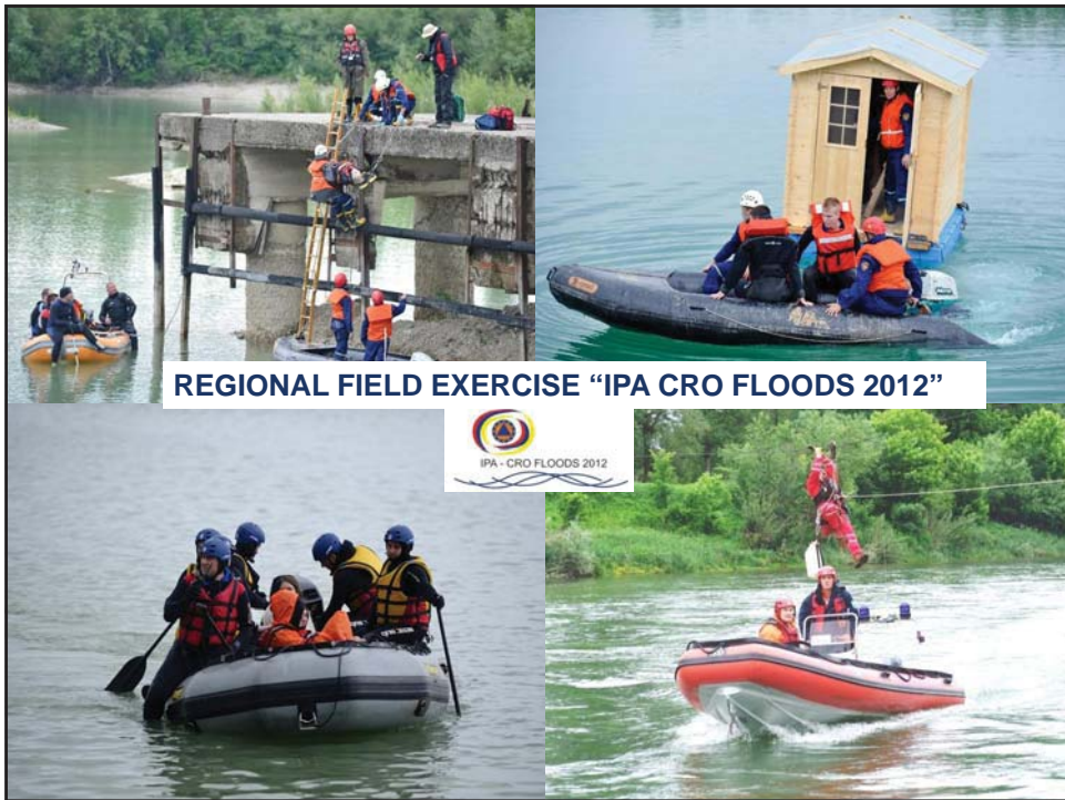
REGIONAL FIELD EXERCISE "IPA CRO FLOODS 2012"