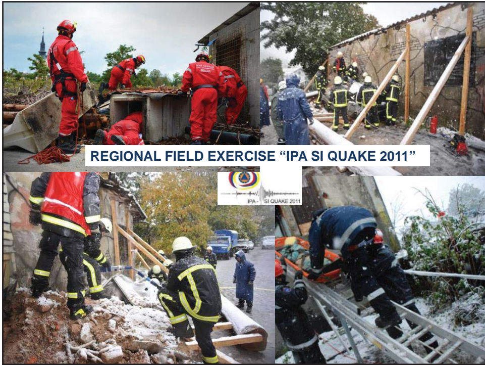
REGIONAL FIELD EXERCISE "IPA SI QUAKE 2011"