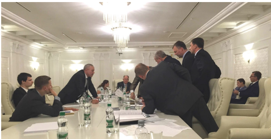
Seventh round of negotiations of the Security Working Group, 5 August 2015.