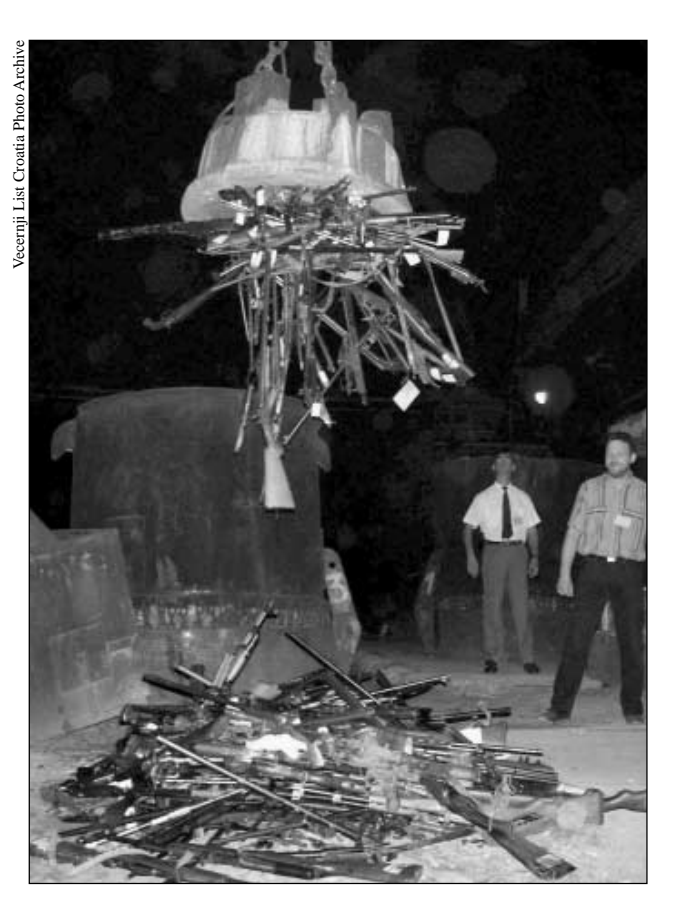
In Croatia, the Government marked the start of the Small Arms Conference in the United Nations by destroying a large quantity of weapons

Implementation of small arms restrictions recently received a boost when Switzerland and Azerbaijan co-hosted a workshop in Baku on 21 and 22 June. The event, entitled 'Small arms and light