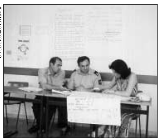
The OSCE/ODIHR and the OSCE Presence in Albania organized a special training course for police trainers on gender-based issues

Last month, the OSCE Presence in Albania successfully completed a training course for Albanian police trainers at the Police Institute in Tirana, focusing on issues of gender, specifically gender roles and stereotypes, domestic violence, and trafficking. Financed by the Anti-Trafficking Unit of the OSCE Office for Democratic Institutions and Human Rights (ODIHR), the course, conducted from 25 to 29 June, was attended by 12 police instructors.