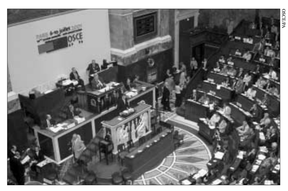
This year's Parliamentary Assembly met in Paris at the Assemblée Nationale

The Paris Declaration also contained resolutions on specific issues such as abolition of the death penalty; the prevention of torture, abuse, extortion or other unlawful acts; combating trafficking in human beings; combating corrup-