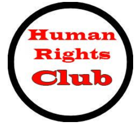
Human Rights Club